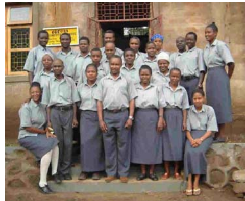
Staff in their chosen uniforms