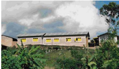
Mbahe primary school is transformed

The first phase of our renovation of Mbahe primary school is complete. The school looks wonderful, and the classrooms are bright and clean with gloss paint, noticeboards, and new tables and benches.