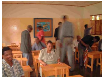
Villagers admire the new nursery classroom

Quest Overseas sent us two groups in January to March 2004 who built a nursery classroom with office and store at Ashira primary school. They not only built it but painted it and furnished it, and started to renovate the old, disused dining hall. We look forward to more groups from both organisations in July 2004.