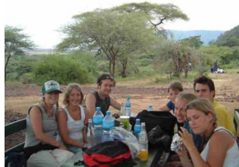
Gap year students' picnic in Lake Manyara National Park

Park for an overnight trip. Unfortunately the lions were elusive, but a cross, stampeding elephant provided a lasting memory for them.