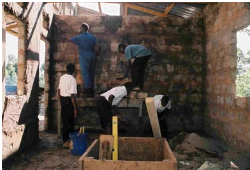
Masonry students begin plastering

Unfortunately the Village Crafts Shop may have to be relocated because of a scheme to widen the main road at Marangu Mtoni. Martine designed a new shop with more display space, and a bigger area for the café. We hope to build this in time for the tourist season in September 2004. The popular café now brings in a healthy income along with the art & craft sales.